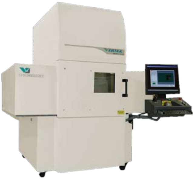
Vertex Series A Audit X-ray Inspection System